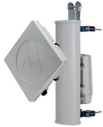
MOTOROLA PMP 320 SUBSCRIBER MODULE & ACCESS POINT

The PMP 320 complements 802.16e WiMAX networks with an outdoor fixed solution that delivers maximum performance, coverage, security and ROI.